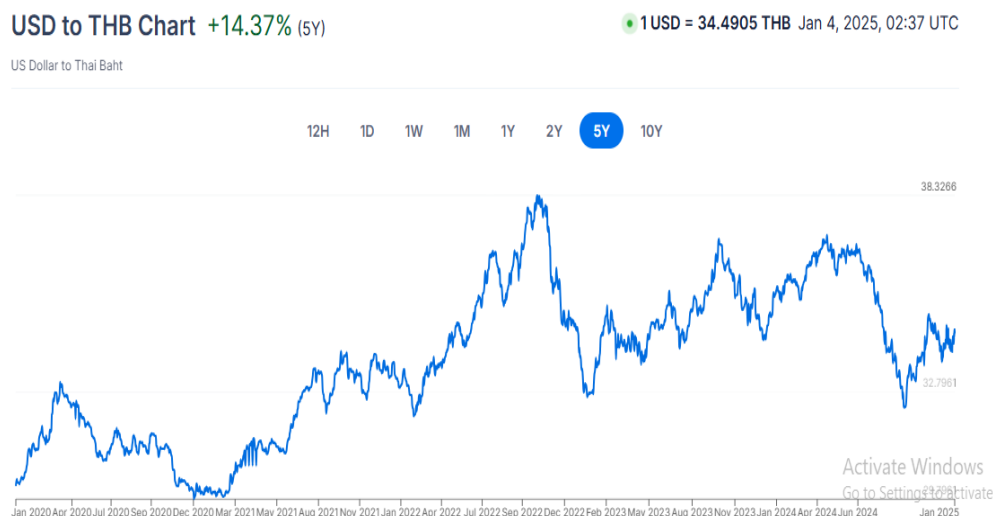
Figure 2. Thai baht/dollar exchange rate

Noted. From “US Dollar to Thai Baht Exchange Rate Chart .Xe Historical Currency Exchange Rates Chart,”by tradingeconomics,2025( https://www.xe.com/currencycharts/?from=USD&to=THB&view=5Y ) In the public domain.