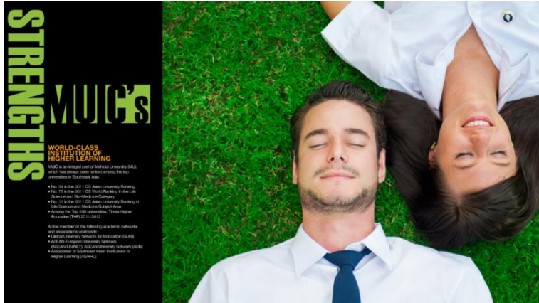
Figure 1 Promotional image from the MUIC Prospectus, 2013.

Figure 2 is an image also taken from the 2013 prospectus. In this publication, the marketing promotes “enhancing lives through a liberal arts education.” Figure 3 is a more recent image taken from the 2016-2017 MUIC General Catalog. Here, there is a discursive shift from the mission to enhance lives, to “be recognized as a world-class liberal education institution.” Some may see this as inconsequential semantics. However, if one is to take organizational identity without cynicism, one may critically observe the shift from an educational discourse to a more symbolic one (to be “world class”). There is also the conspicuous discursive decision to drop “arts” from the vision statement, to give a slightly more marketable “liberal education,” which has the effect of diminishing general education in favour of greater specialization.