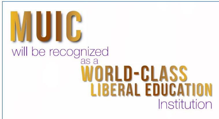
Figure 3 "World-class Liberal Education" from MUIC General Catalog, 2016-17.

These types of ubiquitous imagery with respect to international whiteness, as well as the more nuanced discursive constructs of changing vision statements make up a contemporary world for what Baudrillard calls the “ambient consumer” (cited in Horrocks and Jevtic, 1999). It saturates and conditions a group of consumers to a simulated reality. And because an individual belongs to a group, the individual consumes such a product, generally without criticality.