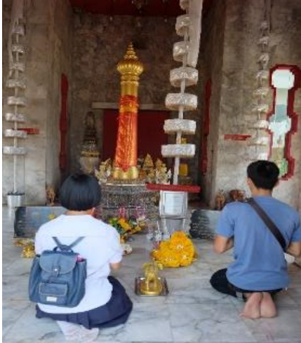
Figure 12 Sisaket City Pillar