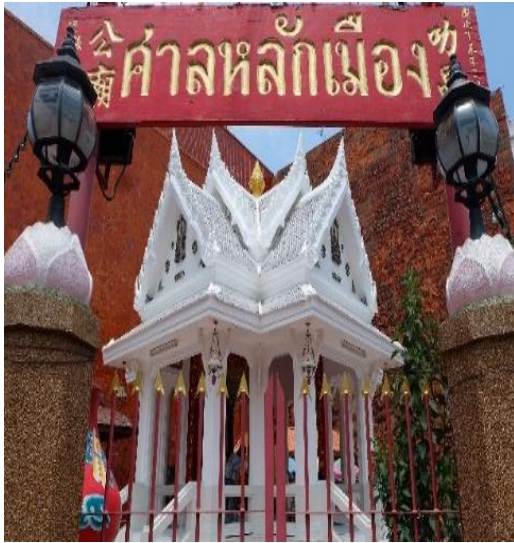
Figure 9 City Pillar Shrine of Nakhon Ratchasima Province