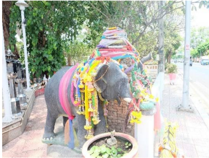
Figure 16 Areas outside of Maha Sarakham city pillar