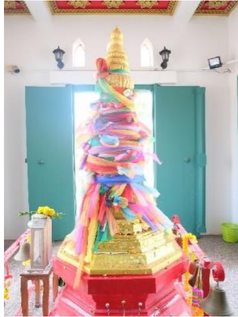
Figure 15 Maha Sarakham City Pillar