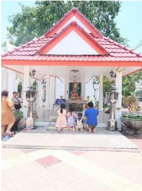
Figure 14 City Pillar Shrine of Maha Sarakham Province

“Originally it was an area of wilderness until during the reign of King Rama IV, Phra Khattiya Wongsa (Chan), the governor of Roi Et at the time, sent an official request to the court to promote the area of Ban Kut Nang Yai to Maha Sarakham city. Thao Maha Chai (Kuat), his nephew, was then entitled the first governor of Maha Sarakham, which was built with assistance from the laborers of Roi Et. When the construction was complete, the original wooden city pillar was simply erected on an outdoor field. Later in 2009, the municipality ordered a construction of the current city pillar building, an open-aired Thai style cement pavilion. The original city pillar was then moved to be installed under pillar building. The city pillar, crafted from wood with the shape of a rice bundle at the top and decorated with gilt lacquer work, is open to the public and worshippers are allowed to decorate it with gold leaf and colorful cloth”