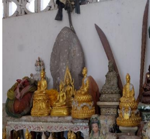
Figure 13 Areas outside of Sisaket city pillar