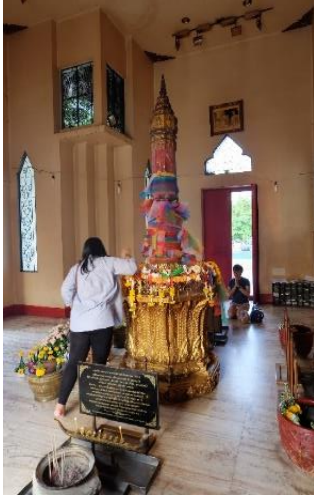
Figure 6 Ubon Ratchathani City Pillar