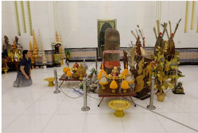
Figure 3 Khon Kaen City Pillar