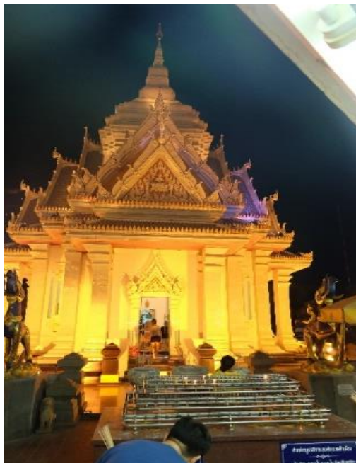
Figure 2 City Pillar Shrine of Khon Kaen Province

The construction design was a public plan which was brought to the public forum meetings of the council in Khon Kaen City 8 times (Commemorative Book for The Celebration of the Khon Kaen City Pillar Shrine, 2007, p. 37) until the project was finally processed when the constructors were brought to visit and study Bangkok City Pillar Shrine and Nonthaburi City Pillar Shrine (Commemorative Book for The Celebration of the Khon Kaen City Pillar Shrine, 2007, p. 42). This shows an effort in attempting to design the province's city pillar shrine to be in accordance with central Thailand's shrines as much as possible.