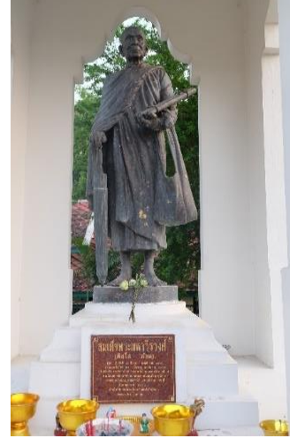
Figure 8 Phra Maha Wirawong