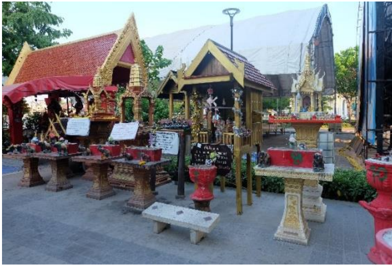
Figure 4 Areas outside of Khon Kaen city pillar