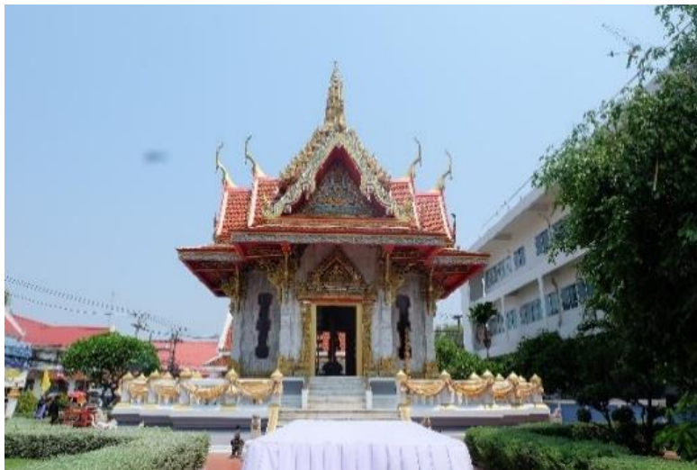
Figure 11 City Pillar Shrine of Sisaket Province

The Sisaket City Pillar Shrine is located at a junction where Thepha Road intersects with Lak Muang Road. The shrine's main structure is a 4-tympana pavilion styled with sculpted stucco, with only 3 entrances as the back is solidly closed with no entrance allowed. The pavilion is adorned with marble, and the south tympanum is decorated with the Golden Jubilee emblem for the occasion marking the 50 th anniversary of His Majesty King Bhumibol Adulyadej the Great's accession to the throne. There is also a stone inscription that His Majesty King Bhumibol Adulyadej the Great assigned His Royal Highness Crown Prince Maha Vajiralongkorn, his title at the time, to visit in his royal stead to open the Sisaket City Pillar Shrine on December 24 th 1987.