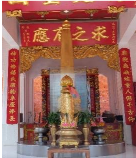
Figure 10 Nakhon Ratchasima City Pillar

Nowadays, the shrine's main structure is a 3-tympana pavilion styled with sculpted stucco, with 3 entrances and a wall on the back side. The inside is decorated with Chinese architecture with the city pillar located in the middle of the hall. Worshippers are allowed to place gold leaves and tie decorative cloth on the actual pillar as well as on the cement statue of the Chinese god of locality, Buntaogong .