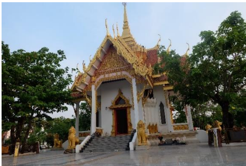
Figure 5 City Pillar Shrine of Ubon Ratchathani Province