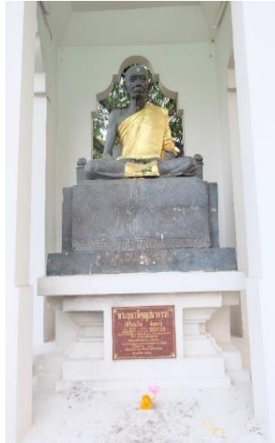
Figure 7 Phra Ubali Khunupamajarn