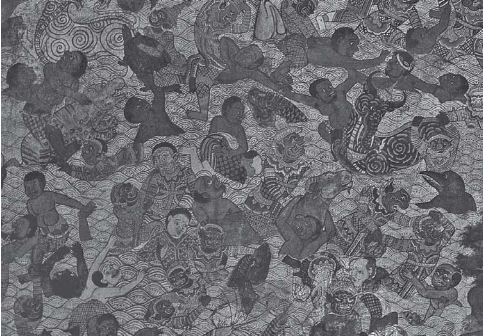
Figure 2. Detail of “The Defeat of Mâra” from the nineteenth century temple painting at Wat Matchimawat, Songkhla, southern Thailand.

hand shows, it had been in a position for meditation, leads the Earth ( Thorani in Thai; Dharani in Pâli) in the form of a woman to emerge. The Earth Goddess wrings her hair and from it floods of water flow and drown Mâra’s army.