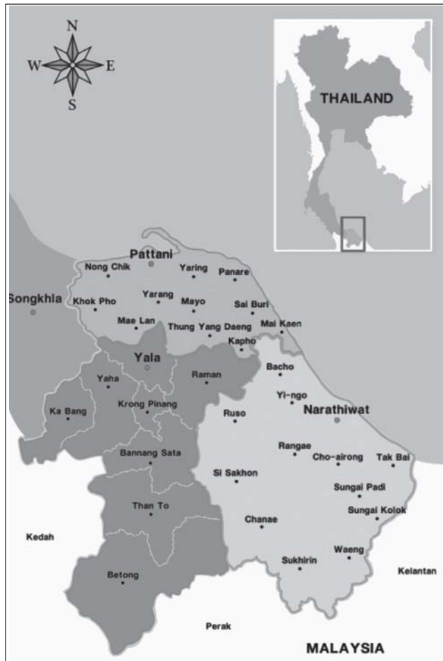
Figure 3. Thailand’s “Deep South” – the provinces of Pattani, Narathiwat, and Yala whose populations are predominantly Malay-speaking Muslims

for moral authority rather than to the establishment sangha. Further, there is a significant, but indeterminate number, of mainly middle-class Thai who are what I have called “post-Buddhists”. That is, they still identify as Buddhists, but rarely participate in Buddhist rites and are intensely secular in their actions. 12